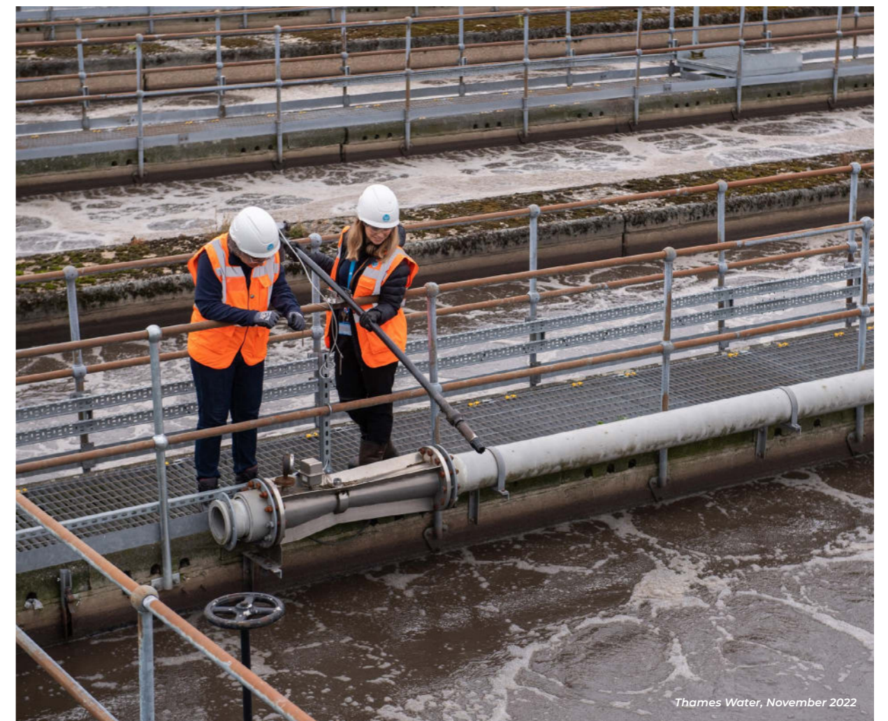
Engineers at a wastewater treatment site collecting a test sample

For further information see the government web page Legal compliance for industry placements