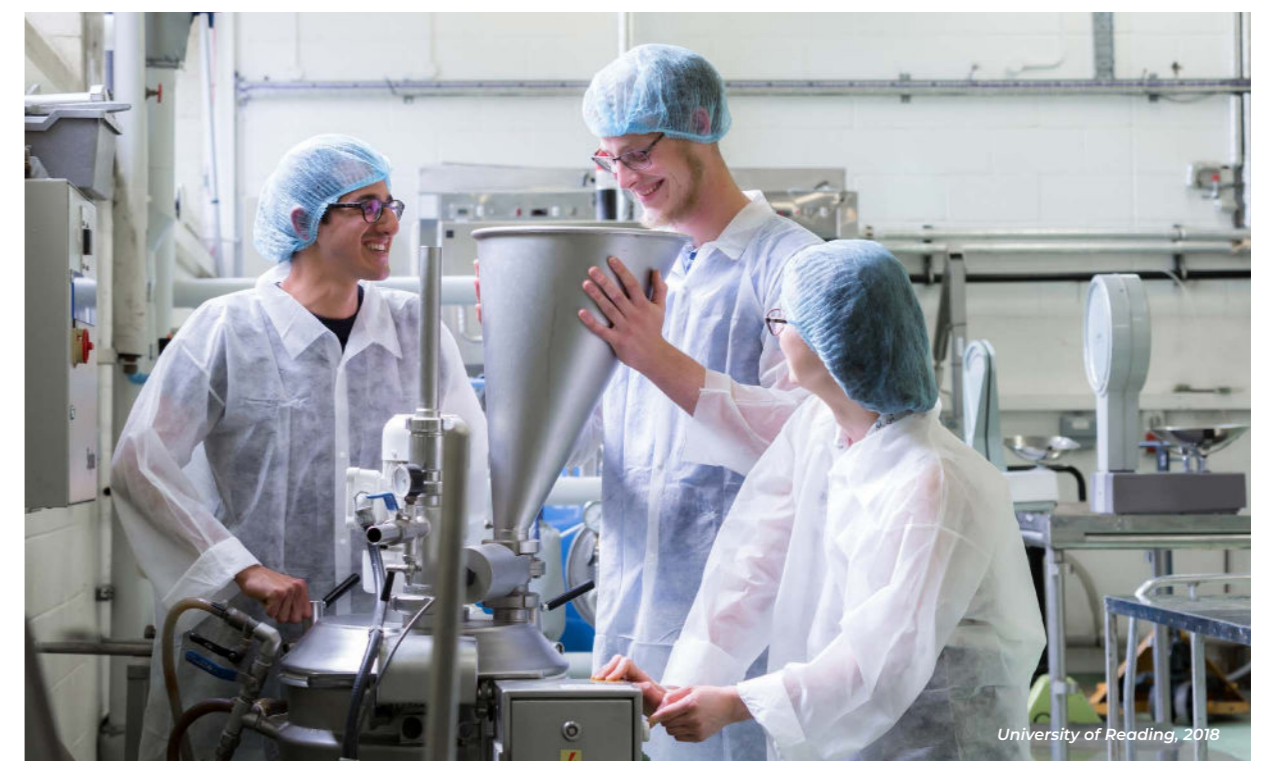
Students doing practical demonstrations in a food science laboratory