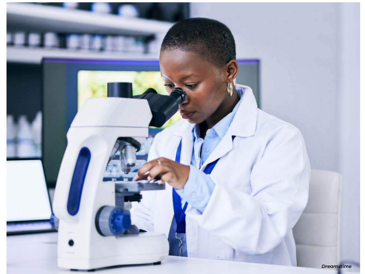
Scientist using a microscope

Not ready to commit to an industry placement? Consider speaking to your local T Level Science provider about giving a talk about your organisation or hosting a site visit. This is valuable to students and gives you an insight into their skills and coursework with minimal commitment.